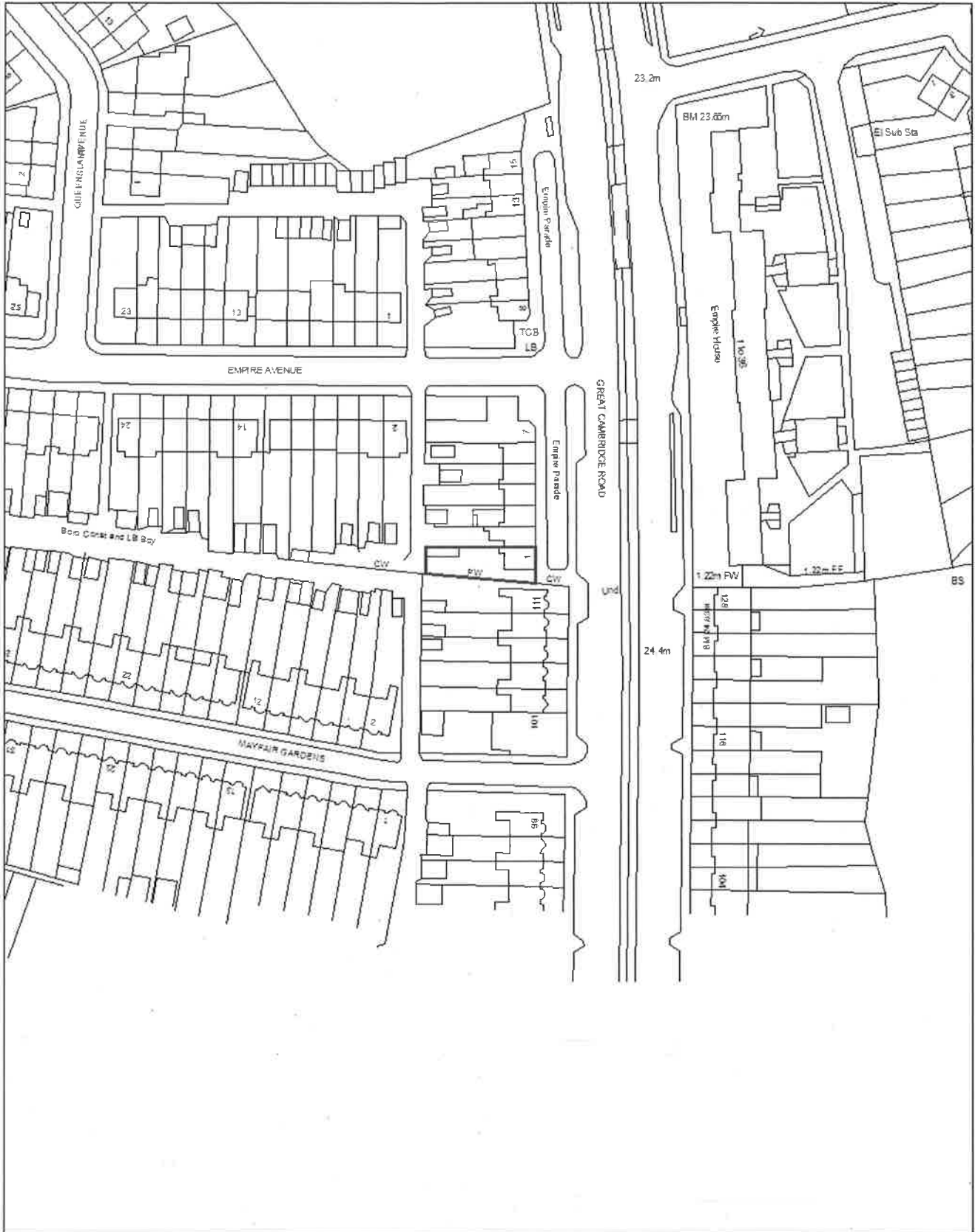
RK Supermarket, 1 Empire Parade, Great Cambridge Road, LONDON, N18 1AA.

LONDON BOROUGH OF ENFIELD CIVIC CENTRE, SILVER STREET, ENFIELD, EN1 3XE www.enfield.gov.uk